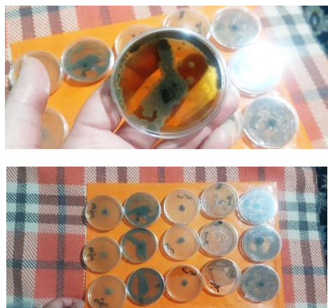
Figure 2. Petri dishes containing the aqueous extract treatments of the tested plants

To propagate a sufficient amount of the primary fungal inoculum, a small block was excised from the margin of young mycelia of Alternaria fungal colonies and transferred to the center of 8-cm Petri dishes. The plates were then incubated for 7 days in an incubator at 25 °C.[43] Experimental design: A completely randomized design with 9 treatments and 6 replicates was employed (Figure 2).